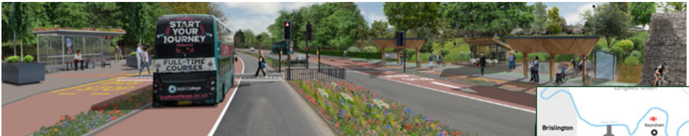
A new mobility hub at Keynsham is proposed to improve access to bus services along the A4

We're asking for your views and comments at a very early stage before we progress any further. Nothing is decided at this stage. The detail still needs to be assessed and is not fixed yet, we'd like your feedback on the overall ideas, rather than the details - what you like, what you don't like, and why. Your feedback will shape what happens next.